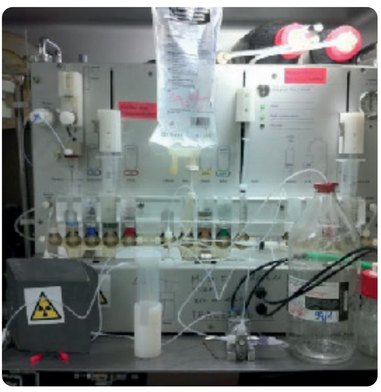
Automated radiosynthesis of Fludarabine